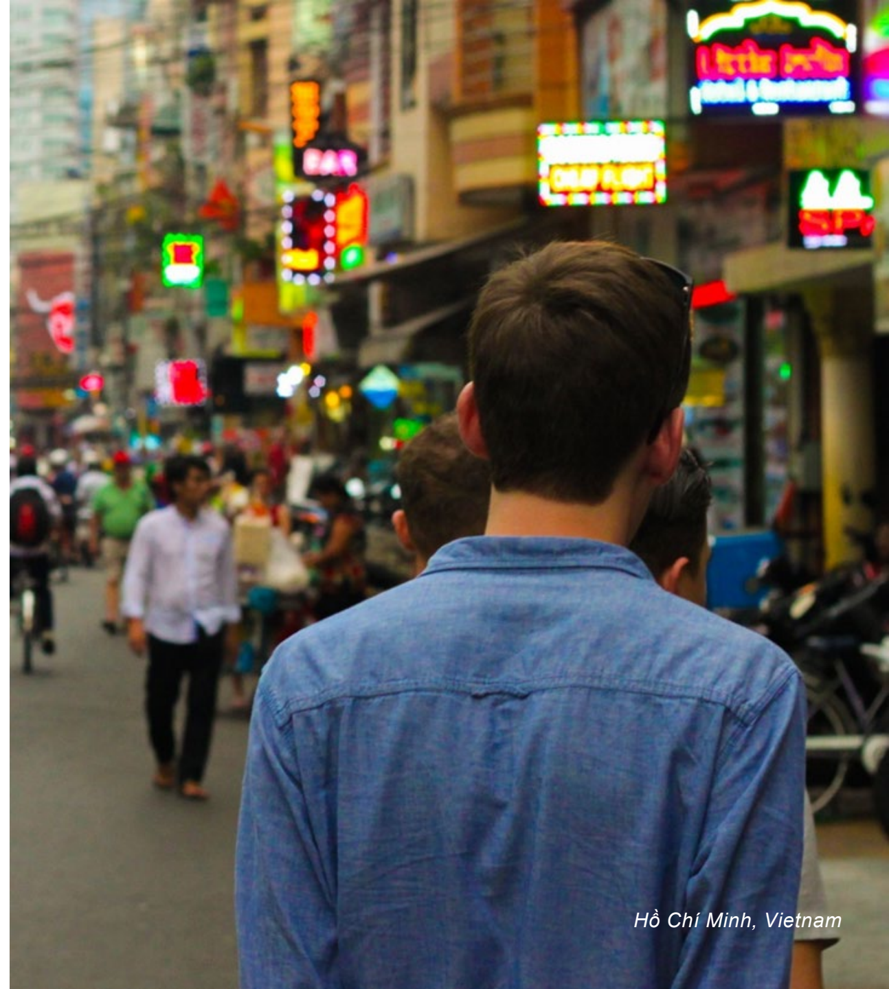
Ho Chi Minh, Vietnam