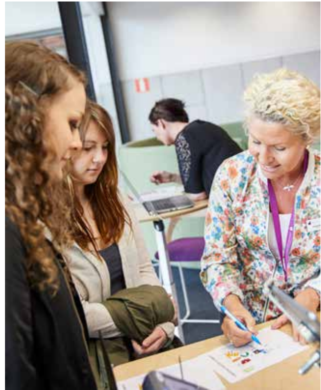
JÖNKÖPING UNIVERSITY February 2019