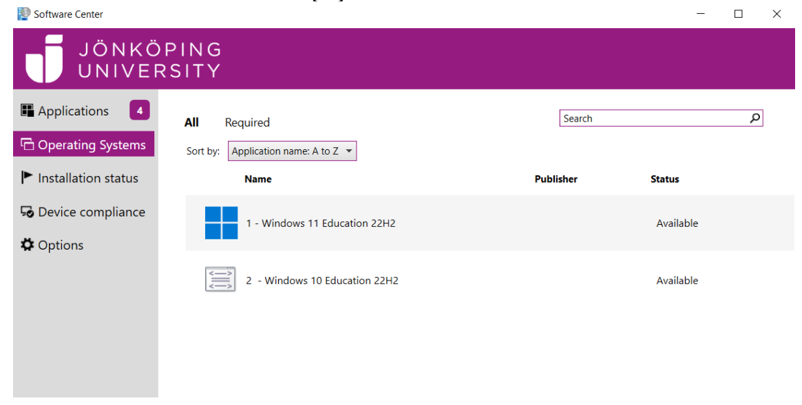
Select "1 – Windows 11 Education [...]"